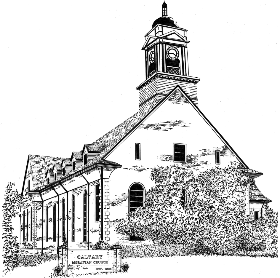
Calvary Moravian Church (Calvary Archives)