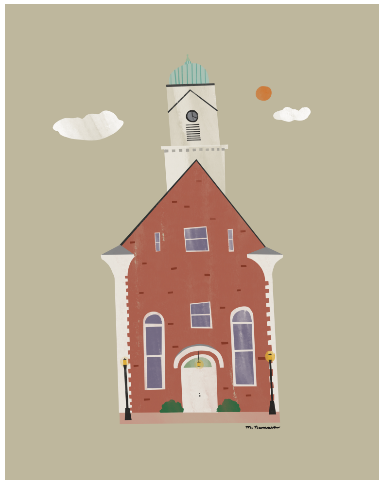
Calvary Moravian Church