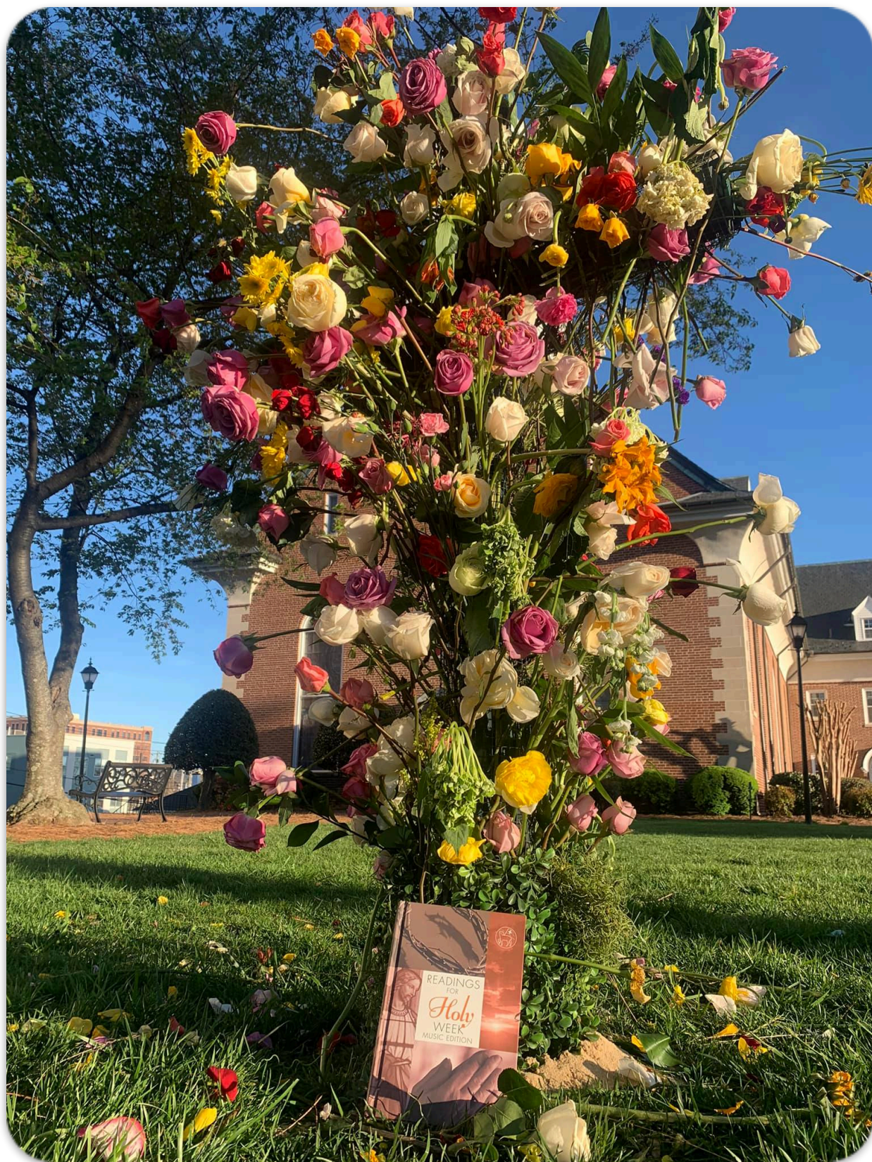
The flowering of the Cross from Palm Sunday 2022